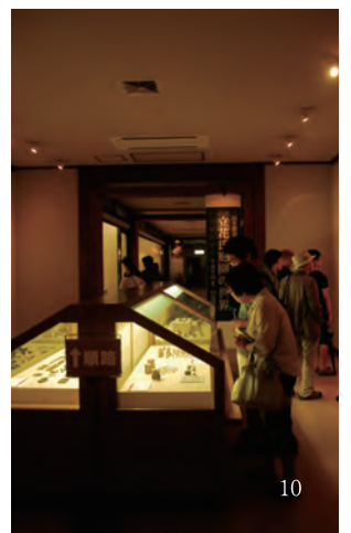
5 松濤園の全景 / 6 立花家の貴重な伝来品(立花家史料館) / 7 立花宗茂肖像 / 8 明治43年(1910)に立花家の迎賓館として建てられた西洋館 / 9 立花宗茂着用の兜 / 10 400年にもわたって連続と受け継がれた伝来品が公開されている立花家史料館